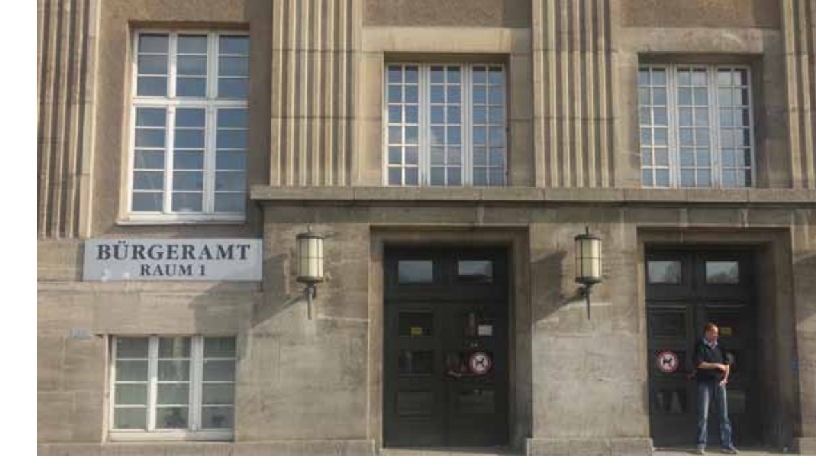
Spandau: City Hall and its citizen's office. Today the architecture would be more transparent

In a world of wicked, interconnected problems and a complex risk nexus the older approach is at best sub-optimal and at worst dysfunctional. Today you can only strive for better rather than perfect outcomes. Nudging at a problem or adapting to new circumstances and dynamics become important but so does the occasional radical re-assessment.<sup>2</sup>